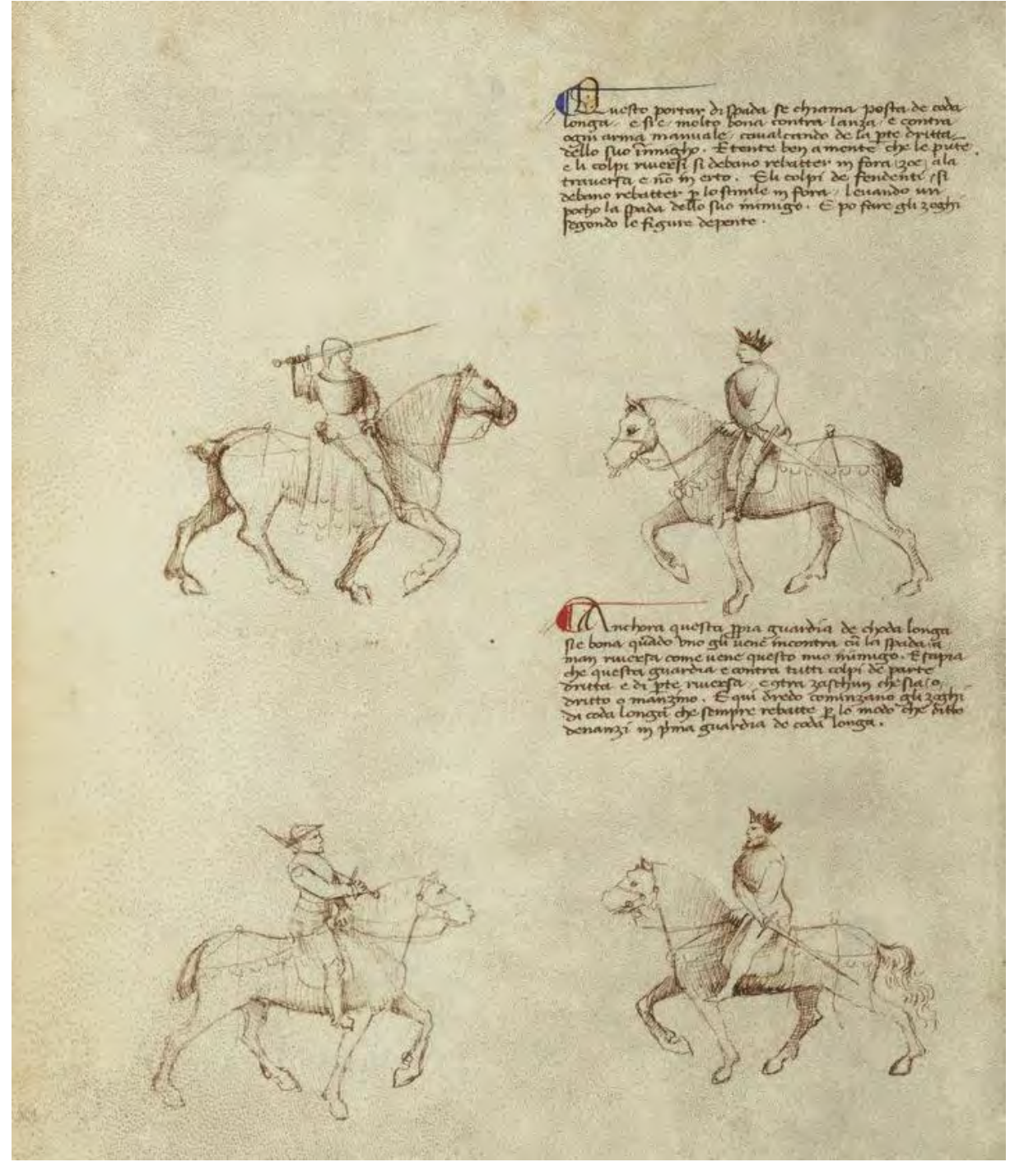
Plate two (on the next page) discusses the first four plays

--Beat aside the blow, put point at chest/head.